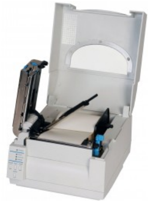
All-metal mechanisms for strength and durability.